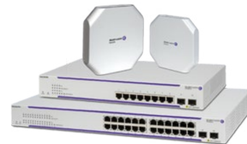
OmniAccess® Stellar WLAN and OmniSwitch® 2220 WebSmart LAN Switches

User centricity: Easy to connect to, excellent quality and secure user experience for employees and guests.